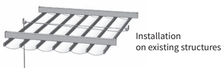
Installation on existing structures