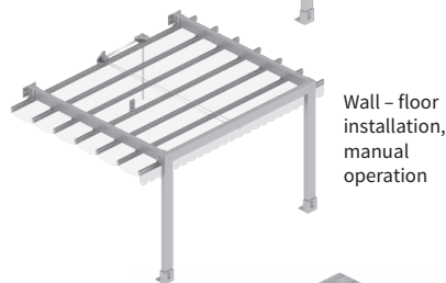
Wall – floor installation, manual operation