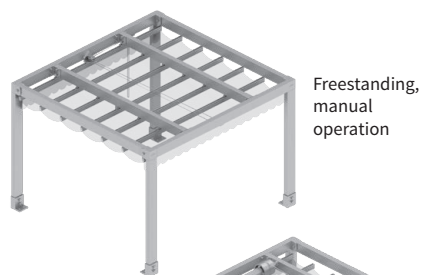
Freestanding, manual operation